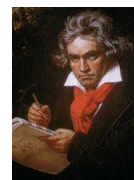
Ludwig van Beethoven